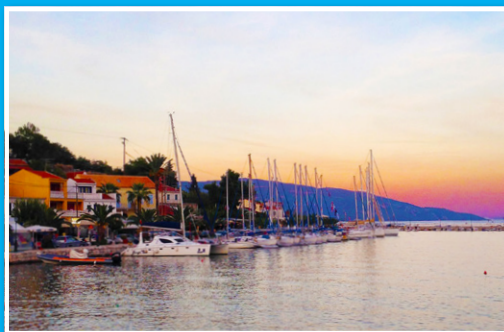
AY. EUPHEMIA, KEFALONIA