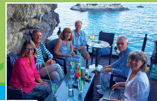
CAVE BAR, POROS