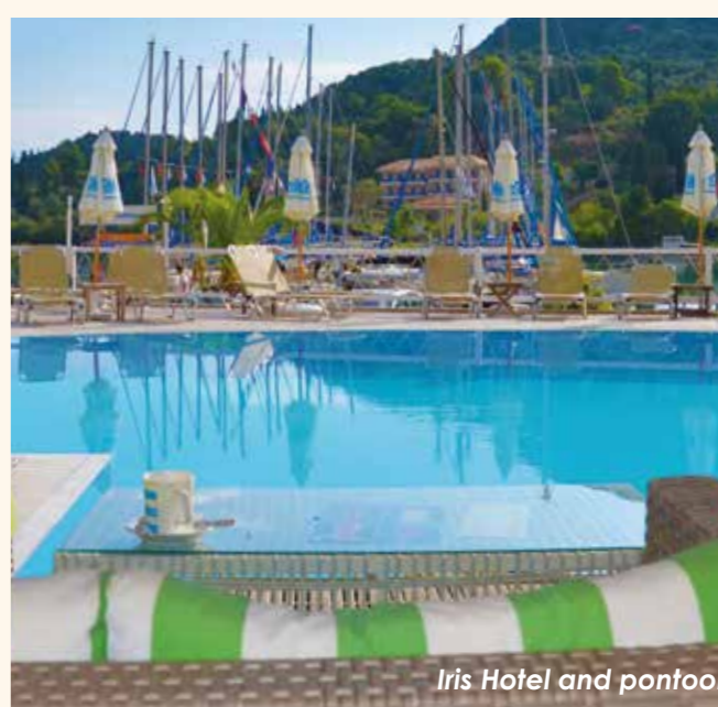
Iris Hotel and pontoon

NOTE: It may be possible to arrange car hire for a lesser number of days. Please give us a call to discuss.