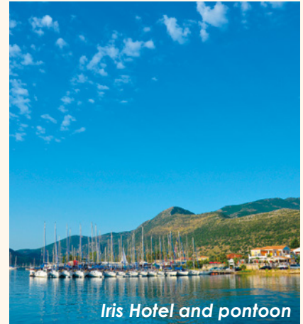
Iris Hotel and pontoon

BOOKING DEPOSIT: 30% OF THE TOTAL ROOM PRICE IS REQUIRED TO SECURE YOUR ACCOMMODATION