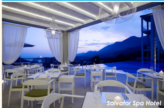
Salvator Spa Hotel