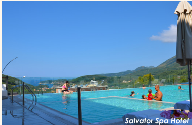
Salvator Spa Hotel