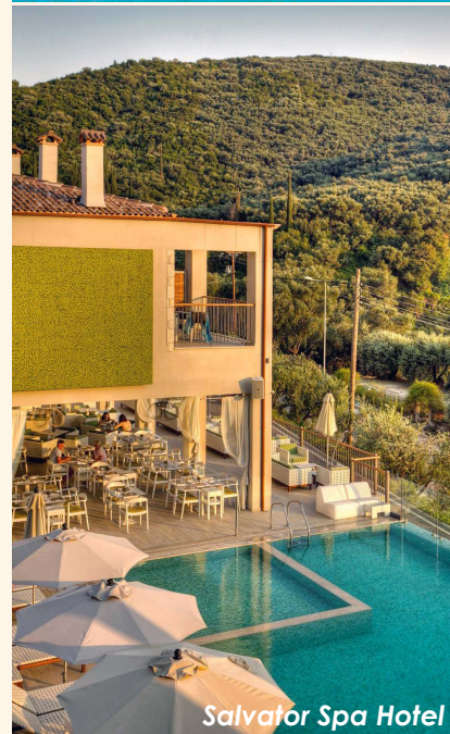
Salvator Spa Hotel

If booking the IRIS HOTEL all transfers are free.