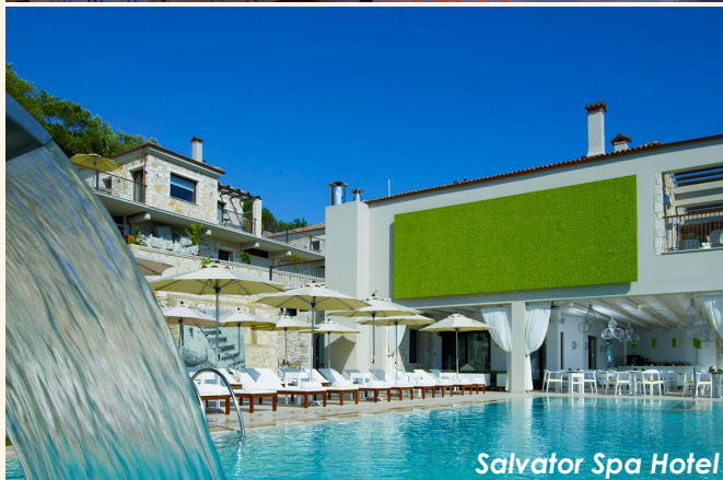
Salvator Spa Hotel