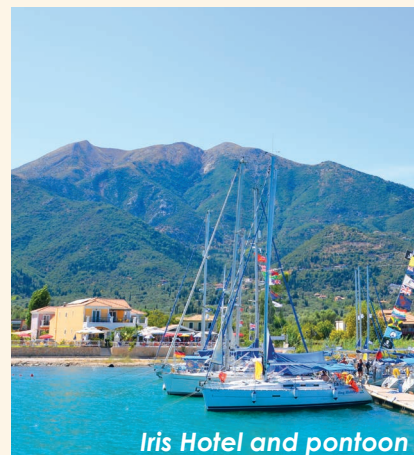
Iris Hotel and pontoon

BOOKING DEPOSIT: 30% OF THE TOTAL ROOM PRICE IS REQUIRED TO SECURE YOUR ACCOMMODATION