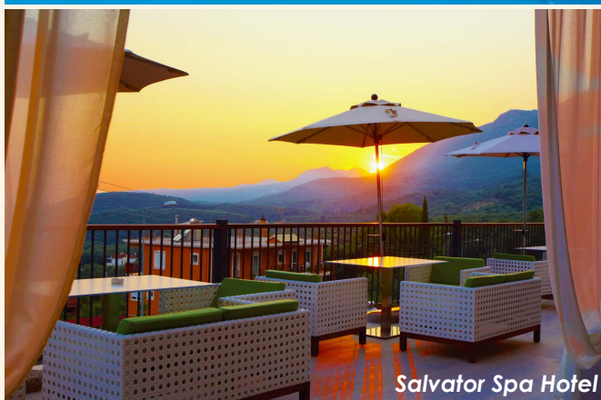
Salvator Spa Hotel