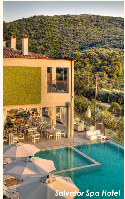
Salvator Spa Hotel

If booking the IRIS HOTEL all transfers are free.