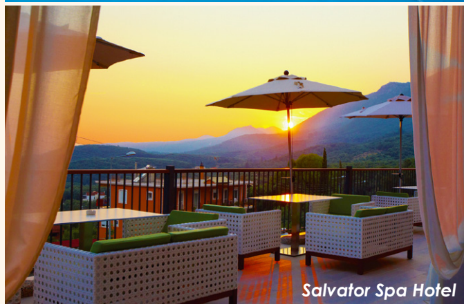
Salvator Spa Hotel