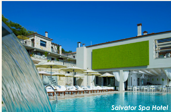
Salvator Spa Hotel