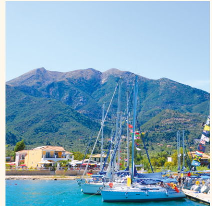
Iris Hotel and pontoon

BOOKING DEPOSIT: 30% OF THE TOTAL ROOM PRICE IS REQUIRED TO SECURE YOUR ACCOMMODATION