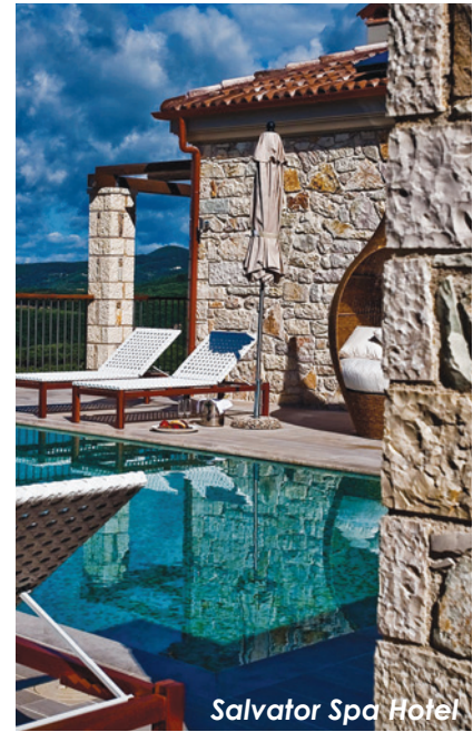
Salvator Spa Hotel

If booking the IRIS HOTEL all transfers are free. If you are booking the SALVATOR SPA HOTEL transfers are not included (between the yacht base, hotel and airport). Your options include: hiring a car or pre-ordering taxis through us (payable locally). The room price does include a free luxury hotel shuttle service to the local town and beaches.