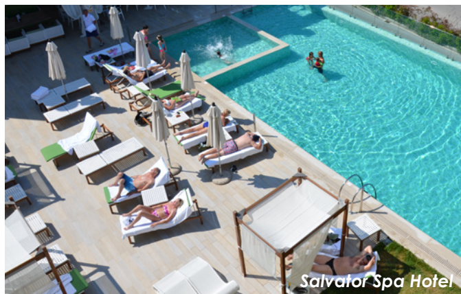
Salvalor Spa Hotel