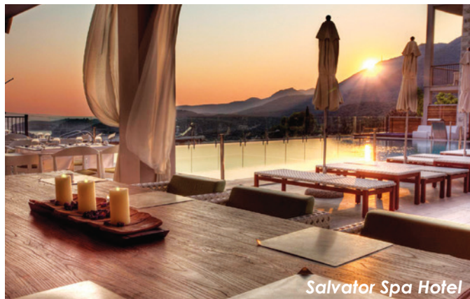
Salvalor Spa Hotel