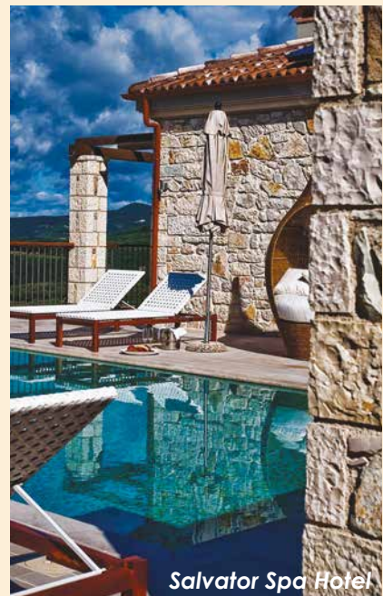
Salvator Spa Hotel

If booking the IRIS HOTEL all transfers are free. If you are booking the SALVATOR SPA HOTEL transfers are not included (between the yacht base, hotel and airport). Your options include: hiring a car or pre-ordering taxis through us (payable locally). The room price does include a free luxury hotel shuttle service to the local town and beaches.