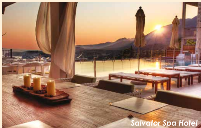
Salvalor Spa Hotel