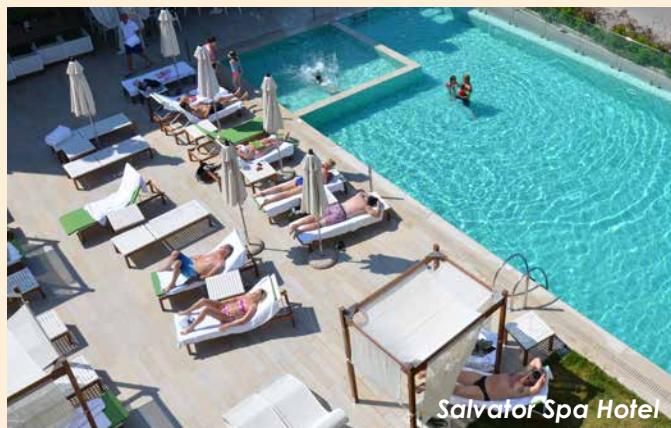
Salvalor Spa Hotel